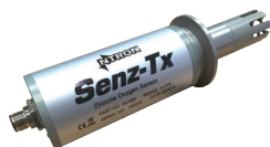
Senz-TX Oxygen Transmitter