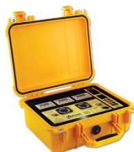
YellowBox Portable Portable Oxygen Analyzer