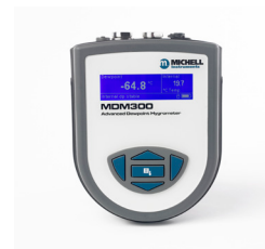
MDM300 Dew-Point Hygrometer