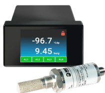
Easidew Advanced Online Dew-Point Hygrometer