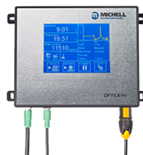
Optidew 501 Chilled Mirror Hygrometer